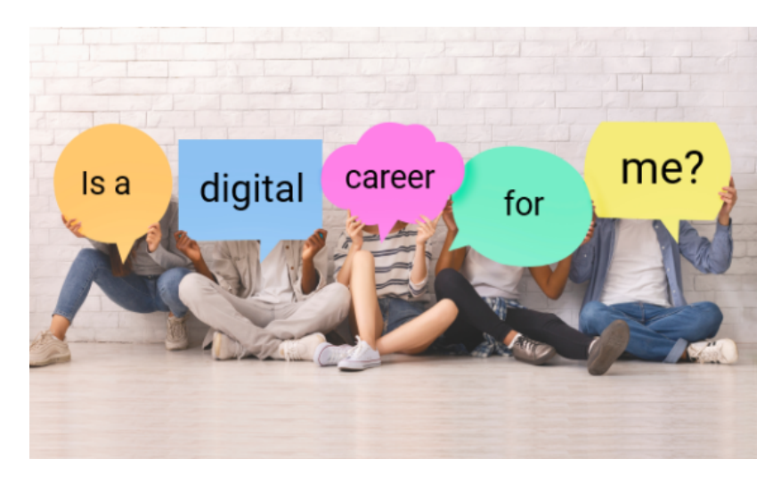
Eight great careers sites for digital and tech

Find out more about the UAL creative degrees we offer. Students will learn about the College and our exceptional facilities, hear from our industry-expert teaching staff and ask any questions they might have about our creative courses or possible careers.